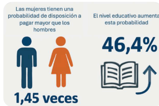
Figure 1. It was shown that women with more education increase the probability of payment compared to men. In original Spanish language

The econometric model (equation 3), which includes a logistic analysis (logit), made it possible to estimate the probability of willingness to pay and its monetary value, highlighting the relevance of variables such as gender, educational level, occupation, valuation of the ecosystem services of the páramo and knowledge about water benefit.